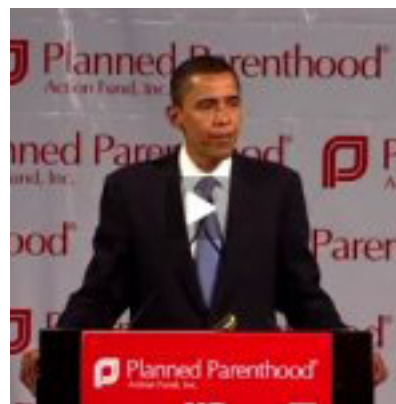
Barack Obama Addresses Planned Parenthood

For more information on this issue, see www.nrlc.org .