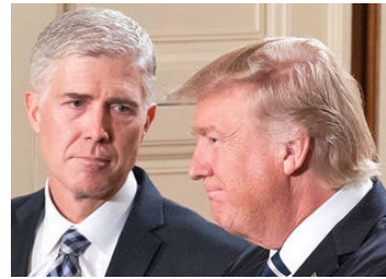
Justice Neil Gorsuch and President Trump

January 31 - President Donald Trump nominated Judge Neil Gorsuch, from the U.S. Court of Appeals for the 10th Circuit in Denver, to fill the vacancy created by the untimely death of Judge Antonin Scalia.